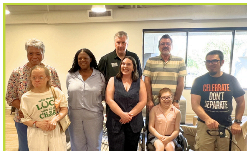
Group photo of CAPC consumers, our CEO, and a few members from CAPC Board of Directors.