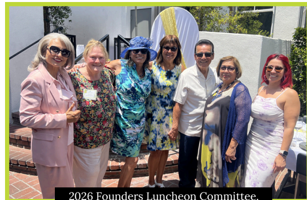
2026 Founders Luncheon Committee.

On June 3, 2026 , CAPC rounded up community leaders, partners, and supporters to celebrate inclusion, community, and leaderships at its annual Founder's Luncheon .