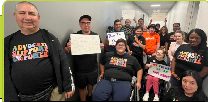
Pictured above is our CAPC CEO, Directors, Staff, and our individuals in the hallway of the state's capitol in Sacramento on May 19, 2026!

On May 19th , CAPC Individuals, family, staff, and our CEO completed a one-day trip to Sacramento for DisCo At the Capitol - an event held by The Arc, ARCA, Easterseals, and United Cerebral Palsy. This event emphasized advocating for an array of people with disabilities as they all got to meet with their local legislators . Meeting with their legislators, CAPC got to advocate for accessibility when it came to official documents, transportation, and medical care.