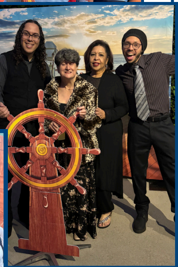
Pictured are CAPC Consumers, friends, and family posing at the photo op station sponsored by Haskell & White.