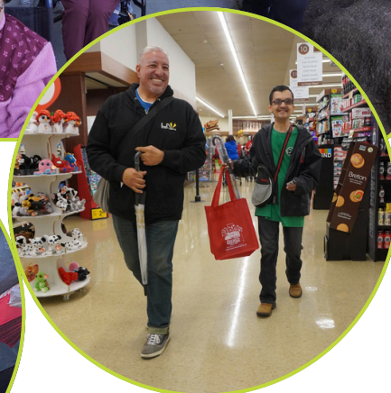
Photos of CAPC consumers and staff pictured at the 2024 Community Harvest Day at Vons market in Whittier.