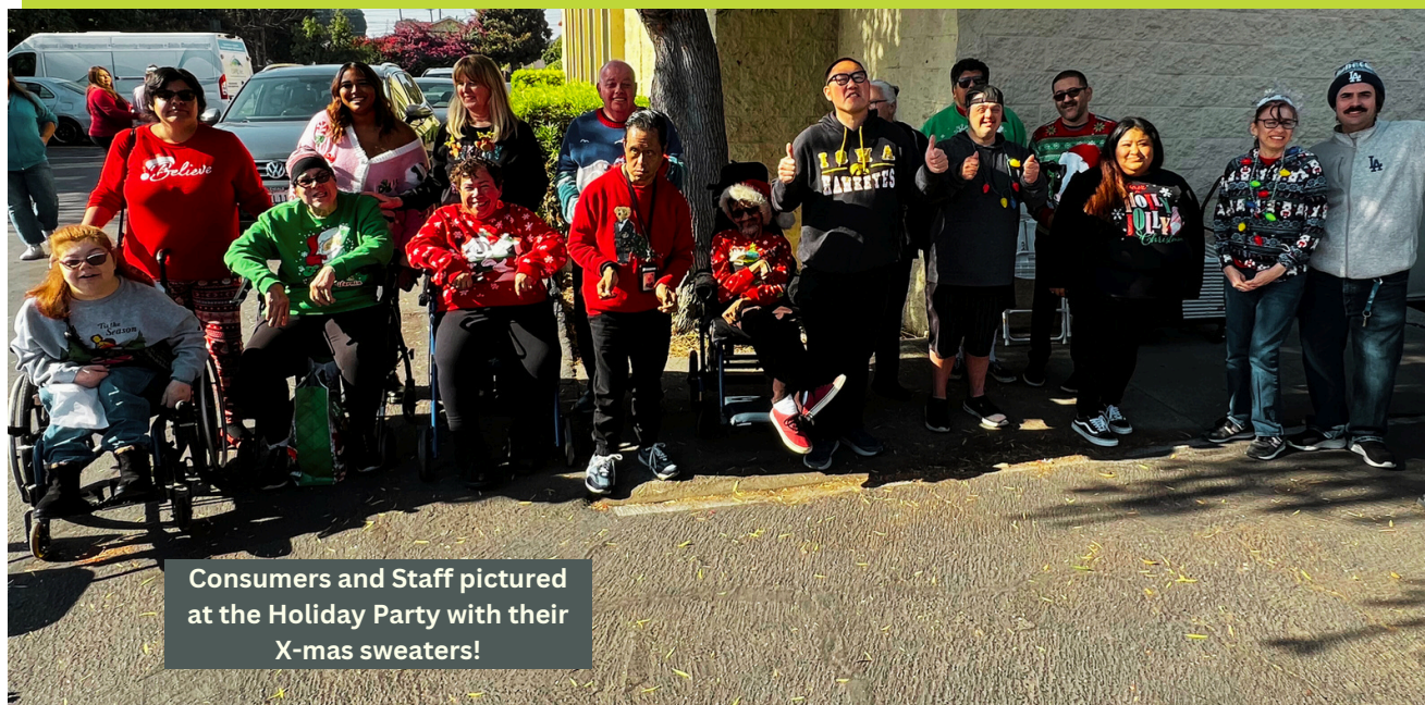
Consumers and Staff pictured at the Holiday Party with their X-mas sweaters!