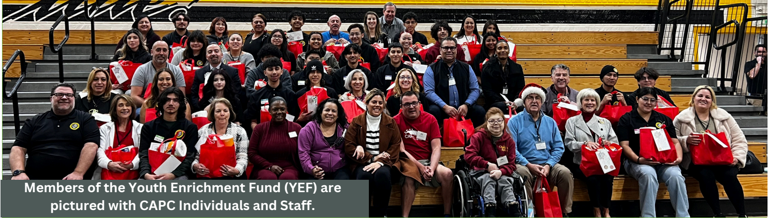
Members of the Youth Enrichment Fund (YEF) are pictured with CAPC Individuals and Staff.

We extend our deepest gratitude to the Youth Enrichment Fund program for supporting CAPC, Inc. individuals by assembling Care Bags, assisting our community members with developmental disabilities. The Care Bags consisted of household and self-care supplies, along with a heartfelt holiday note from the mentors and mentees.