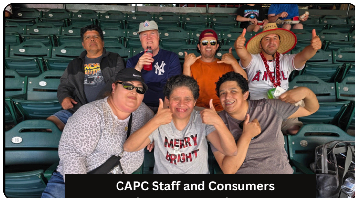
CAPC Staff and Consumers at last year's Angel Game.